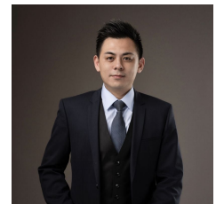
Plus Agency Ryde 1300 572 155