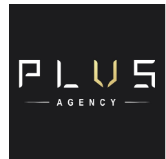
Plus Agency Sales