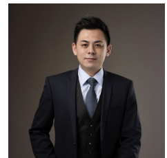
Plus Agency Ryde 1300 572 155