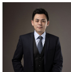
Plus Agency Ryde 1300 572 155

View : https://www.plusagency.com.au/sale/nsw/northern-suburbs/ryde/residential/apartment/7759724