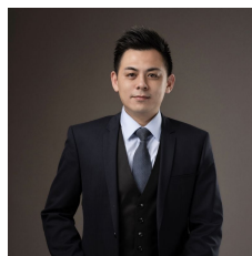
Plus Agency Ryde 1300 572 155

View : https://www.plusagency.com.au/sale/nsw/northern-suburbs/ryde/residential/apartment/7759724