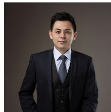
Plus Agency Ryde 1300 572 155

View : https://www.plusagency.com.au/sale/nsw/northern-suburbs/meadowbank/residential/apartment/7701972